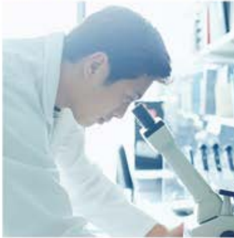
BRINGING ADVANCES IN RESEARCH TO PATIENTS

7.6M RAISED TO FUND BLOOD CANCER RESEARCH